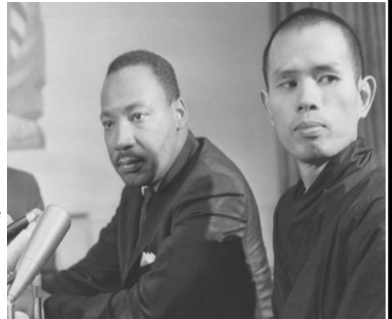
Thich Nhat Hanh was a close friend of Martin Luther King, Jr.