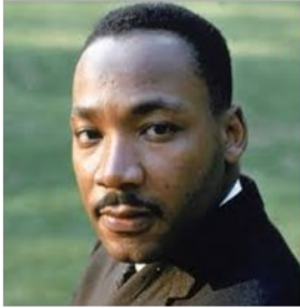
Martin Luther King Jr.