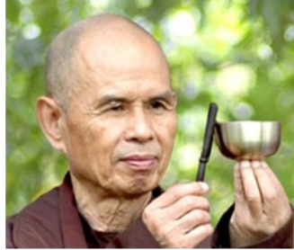
Thich Nhat Hanh