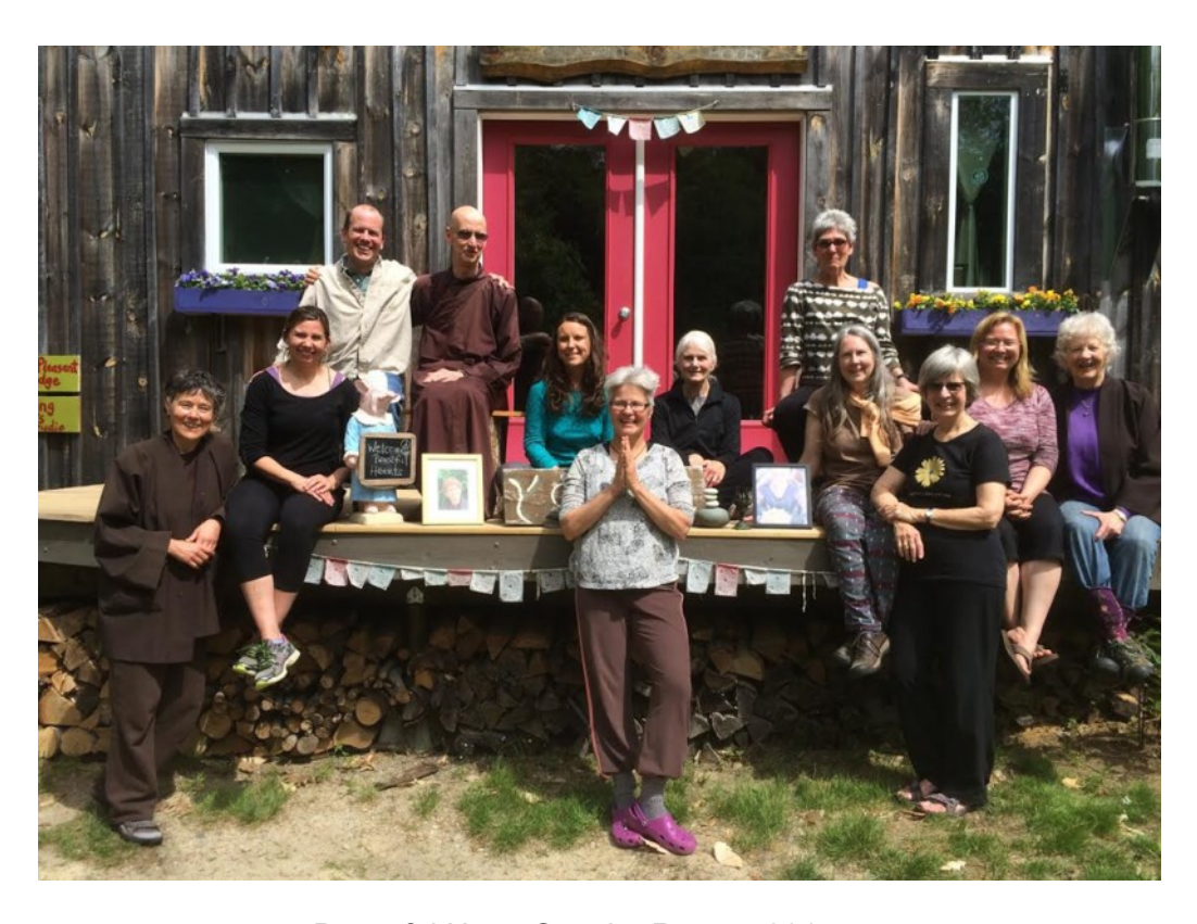
~ Peaceful Heart Sangha Retreat 2015 ~

What a beautiful June morning with warm sunshine and a gentle breeze. How incredibly lucky we all are to be alive at this moment.